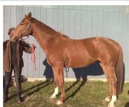
Montgomery County Police released this photo of Addie, a horse that was stolen early this month from a stable in Damascus.